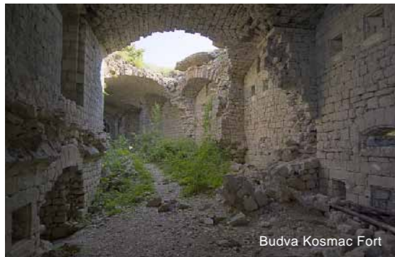
Budva Kosmac Fort

Montenegro is one of the Mediterranean's hidden gems. It is a land of rugged snow-capped mountains, ancient forests and pristine lakes, where ancient monasteries cling to rocky cliffs and imposing stone churches speak of centuries past. Its capital and largest city is Podgorica, while Cetinje is designated as the old royal capital and the former seat of the throne.