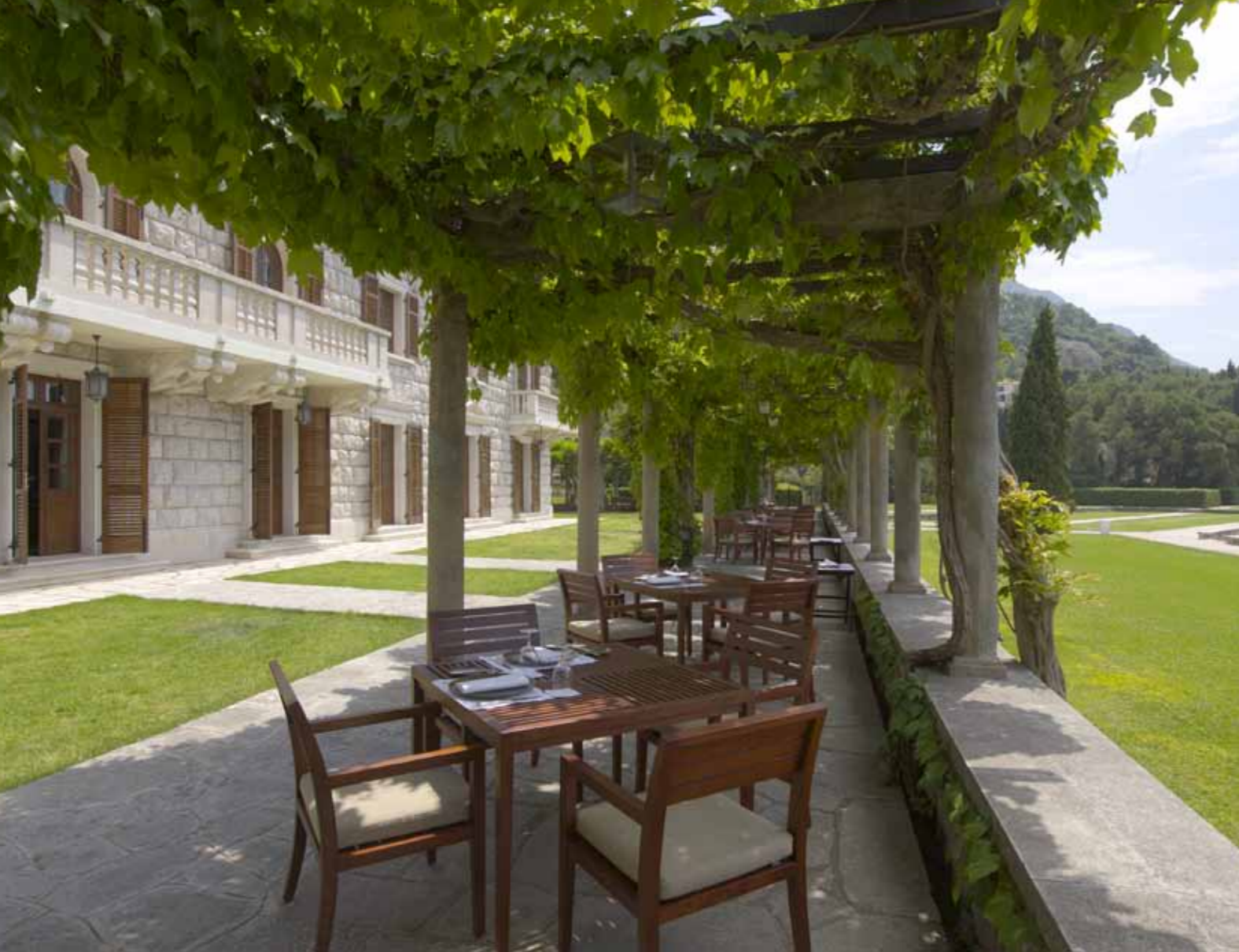
VILLA MILOČER - LOGGIA: Open for breakfast, lunch and dinner, Loggia ( left and above right ) features a wisteria-covered colonnade which provides a shady retreat and views of the bay.