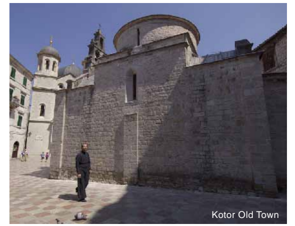
Kotor Old Town