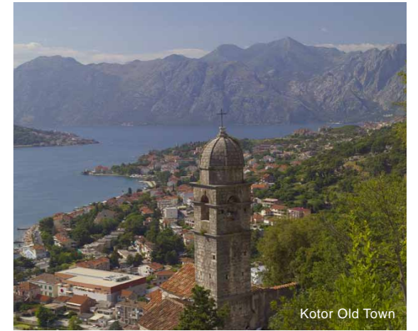
Kotor Old Town