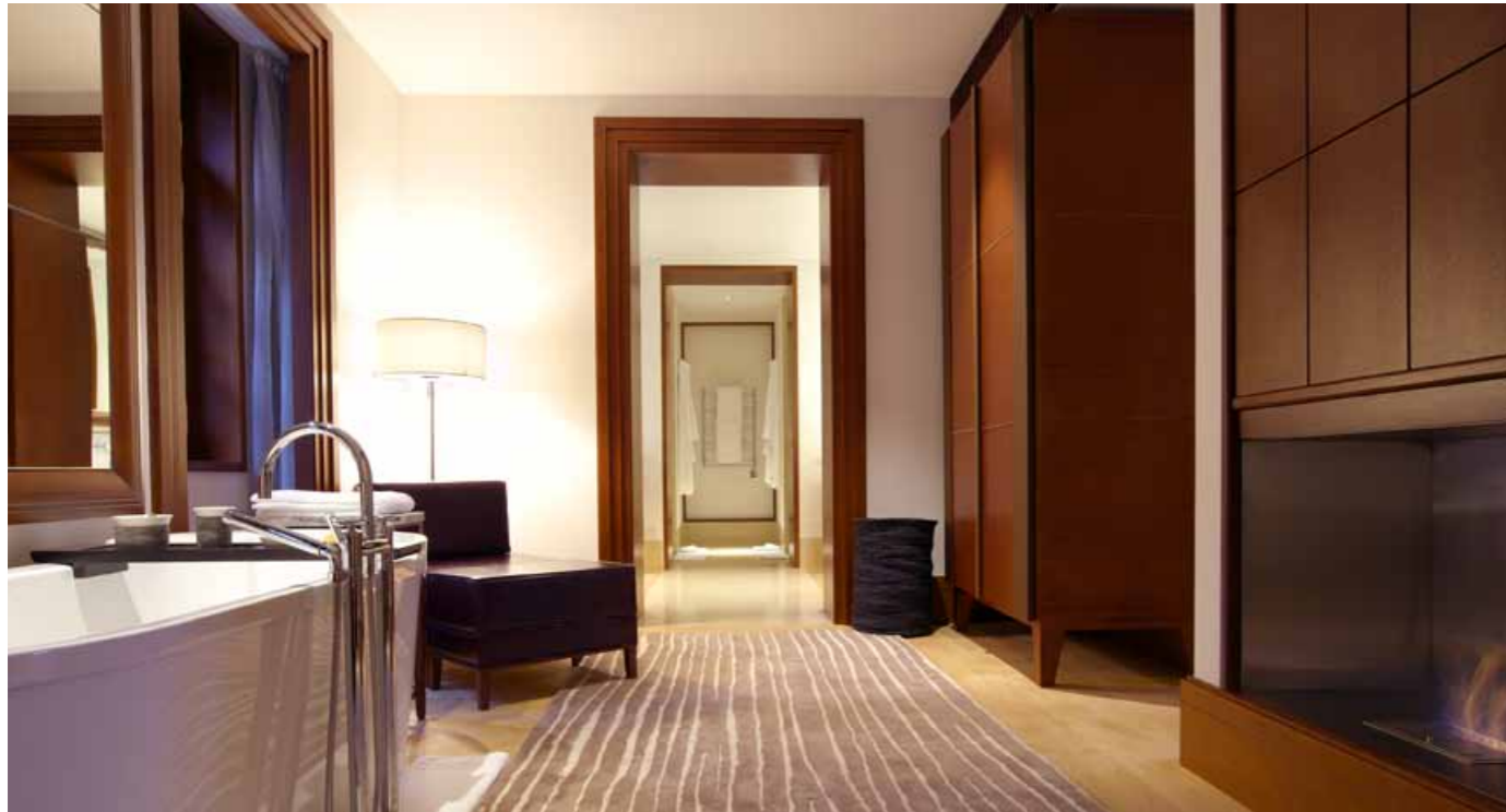
The two Queen Marija Suites ( pictured ) are housed in a separate structure – one on the ground floor with a small terrace, the other upstairs with ocean views. Each includes four separate rooms: a bedroom, bathroom, living room and dining room. A fireplace is located in both the living room and bedroom of each suite.