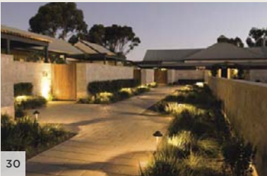
THE LOUISE Barossa Valley, South Australia