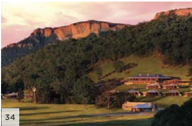
WOLGAN VALLEY RESORT & SPA Blue Mountains, New South Wales