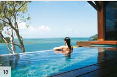
QUALIA Great Barrier Reef, Queensland