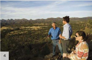
ARKABA STATION Flinders Ranges, South Australia