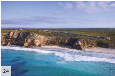
SOUTHERN OCEAN LODGE Kangaroo Island, South Australia