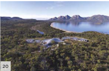
SAFFIRE Freycinet, Tasmania