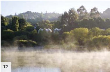
LAKE HOUSE Daylesford, Victoria