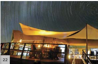
SAL SALIS Ningaloo Reef, Western Australia