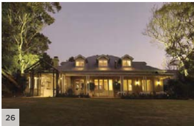
SPICERS CLOVELLY ESTATE Sunshine Coast Hinterland, Queensland