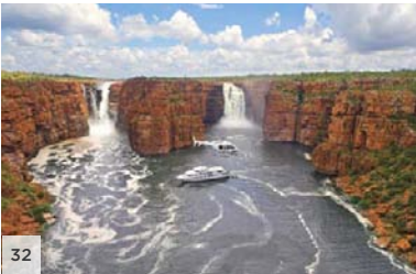
TRUE NORTH The Kimberley, Western Australia