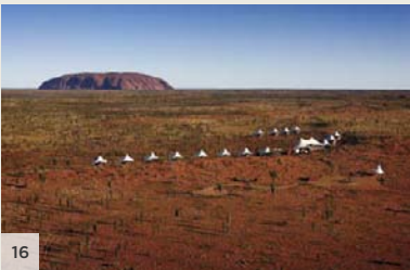
LONGITUDE 131° Ayers Rock (Uluru), Northern Territory