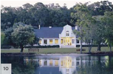
CAPE LODGE Margaret River, Western Australia