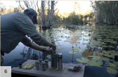
BAMURRU PLAINS Top End, Northern Territory