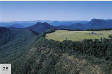
SPICERS PEAK LODGE Scenic Rim, South East Queensland