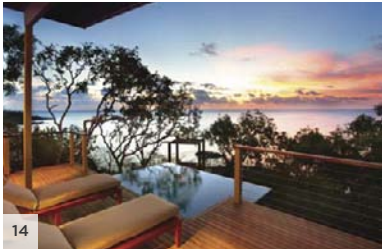
LIZARD ISLAND Great Barrier Reef, Queensland