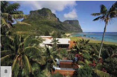
CAPELLA LODGE Lord Howe Island, New South Wales