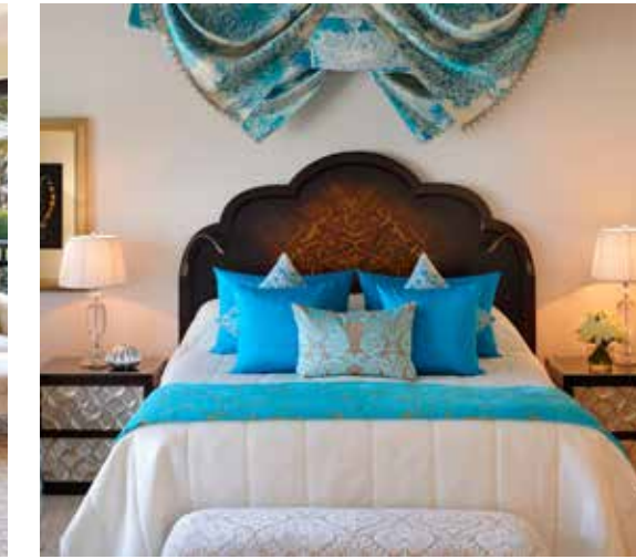
Master Bedroom, Executive Suite - Arabian Court