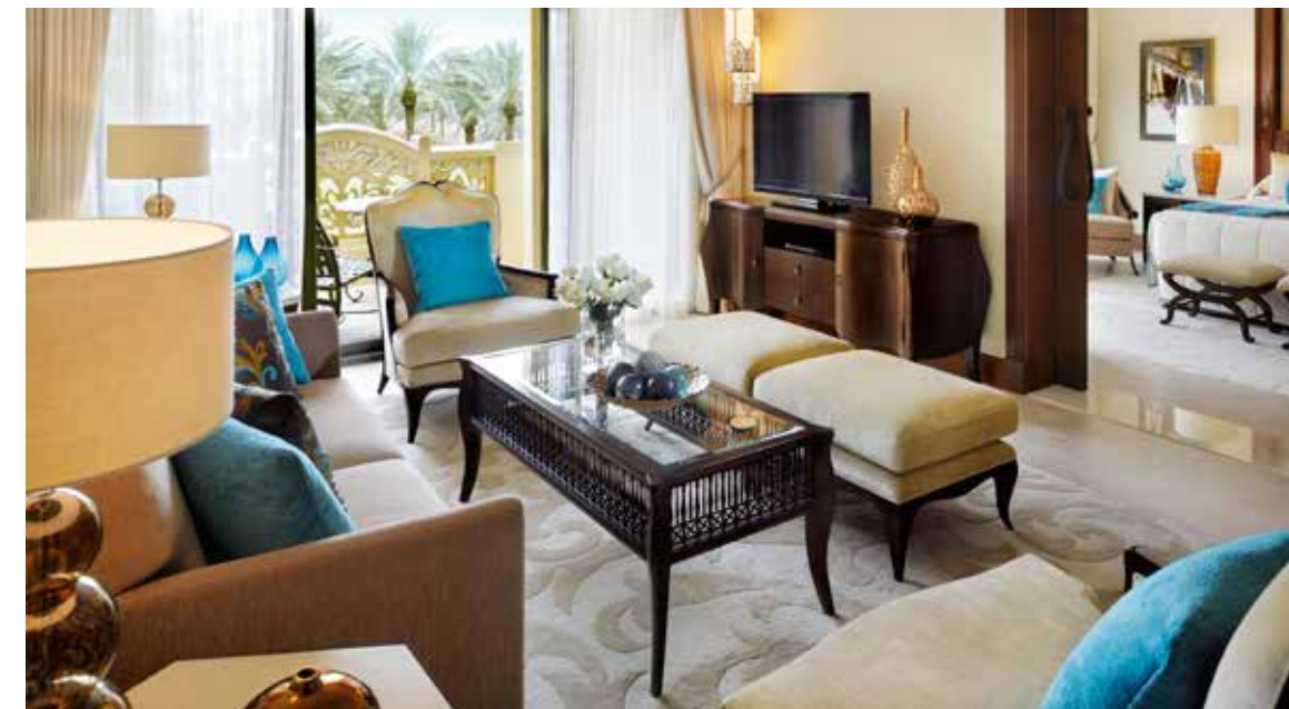
Executive Suite – The Palace

Impeccably styled, two independent bedrooms of 70 and 100m 2 are separated by an elegant 'Arabesque' style lounge, dining room and entertainment area. An intimate shaded terrace opens to a private temperature-controlled swimming pool with gazebos.