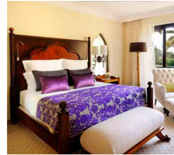
Master Bedroom, Executive Suite - Residence & Spa

Exquisitely detailed, located on the fourth (top) floor, the magnificent Prince Suites offer an impressive outdoor terrace with 'Majlis' style seating, large dining table and sun-loungers. Luxurious bathrooms are spacious and adorned with wood, marble and slate.