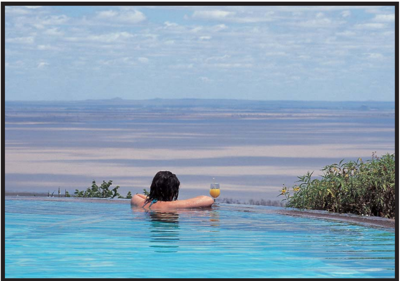
Voted amongst the best pools in the world

The lodge has 67 bedrooms and a stunning swimming pool with exceptional views of Lake Manyara. Activities, which are one of the lodge's specialities, include daily excursions to the Great Rift Valley and National Park, walking safaris, mountain bike and canoe safaris, mountain climbing, nature walks and traditional dance performances in the evenings. The lodge is a favourite of young clients seeking adventure activities and of those looking for a safari experience that is different from the usual one and which brings the visitors into close contact with nature and wildlife.