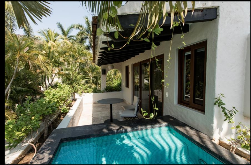
KING BED ROOM