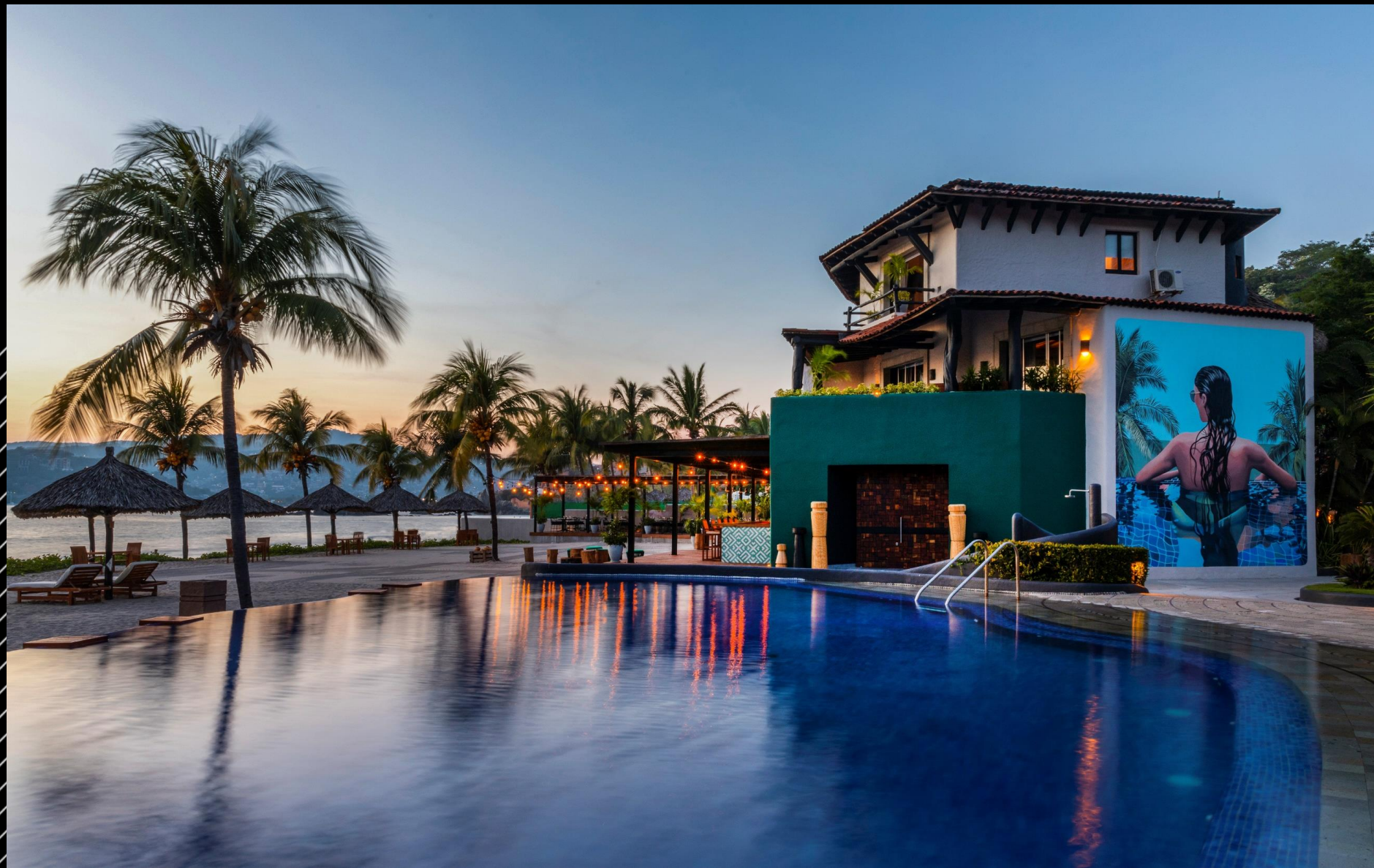
ALBERCA HAO | HAO POOL