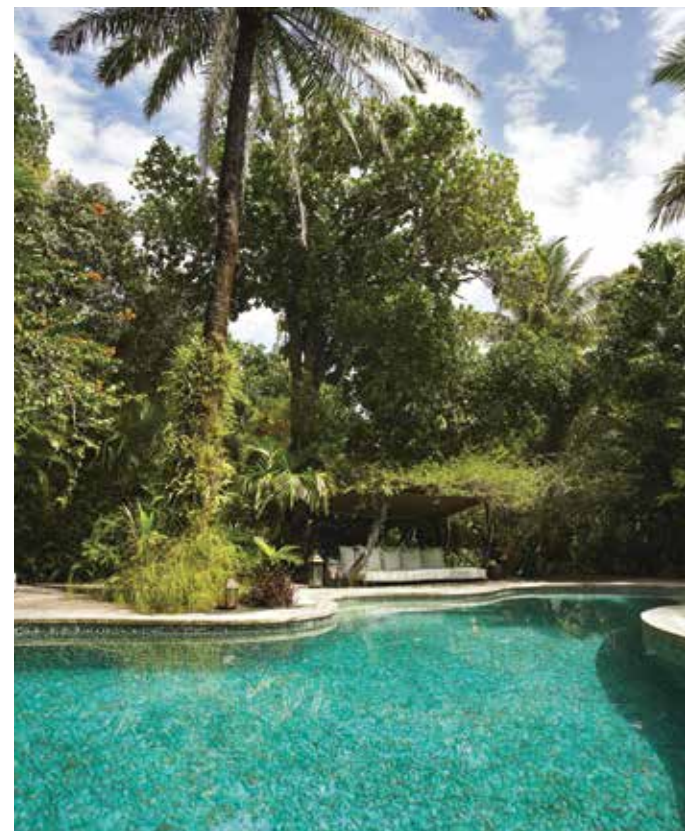
UXUA merges five restored colonial casas on the Quadrado with a lush garden containing six tropical dreamhouses, a spa, restaurant and quartz pool, plus a beach lounge a short walk away. This village-within-a-village was created by designer Wilbert Das working beside local artisans and artists using traditional methods and reclaimed materials.