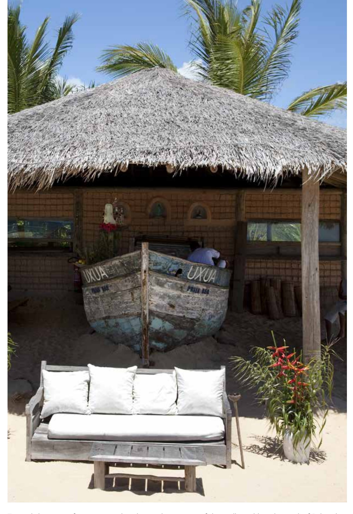
Tropical climate, rainforest, pristine beaches, and picturesque fishing villages bless the south of Bahia, the legendary 'discovery coast' where Portuguese explorers first colonized Brazil in 1500.